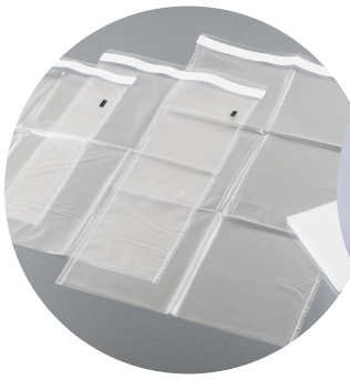
Sterility Maintenance Bags