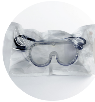
Sterile Cleanroom Apparel Packs