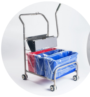
Sterile Mop Bucket Liners